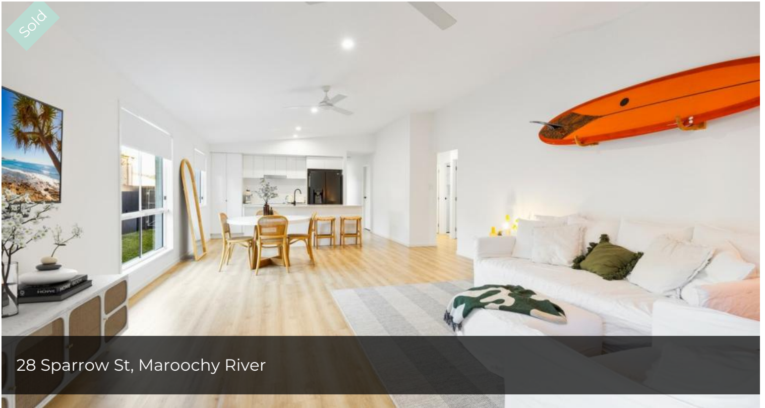
28 Sparrow St, Maroochy River