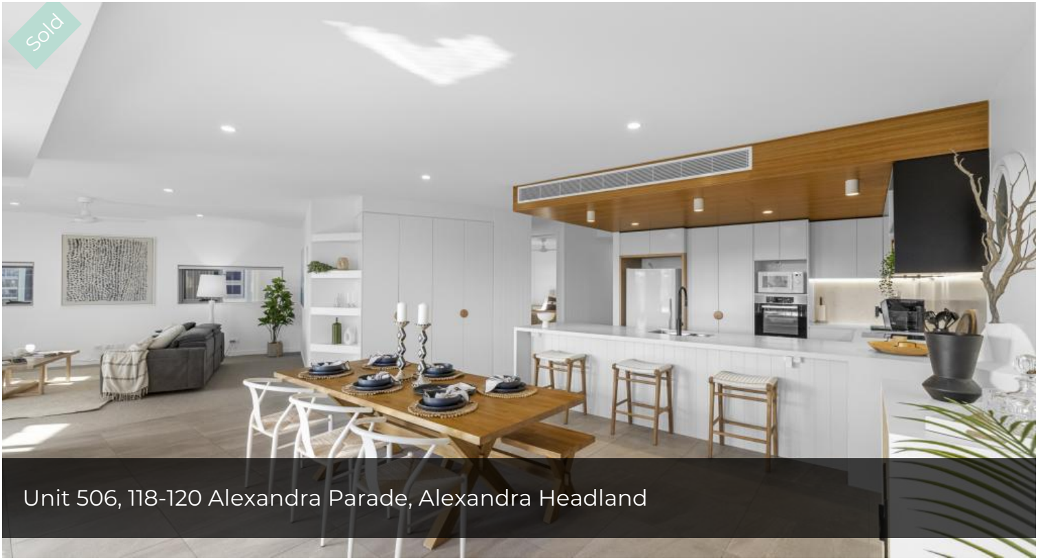
Unit 506, 118-120 Alexandra Parade, Alexandra Headland